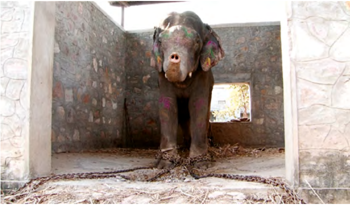
Chained, injured, sick and eventually dead – the plight of elephants in so-called Hathi gaon near Jaipur.

capture and ownership. In India, there are approximately 2675 captive elephants with more than 1800 owned by private individuals. The Covid-19 situation exposed the vulnerability of owners to market forces. Together with the near absence of congregations and the closure of traditional venues where these animals are displayed, ridden, exposed to tourists and paraded, the avenues of income generation was abruptly switched off. Owners today are unable to have their expenditures matching the income and the profit the elephants generated.