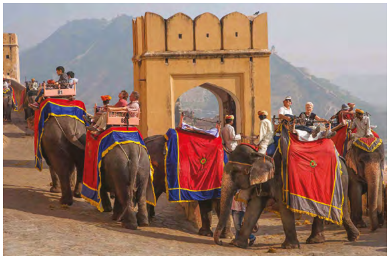
Tourists ride on elephants in Ajmer, unbeknownst the animals' suffering.

Elephants in captivity under private ownership have borne the worst brunt of the effects of the Covid-19 pandemic. They remain significant susceptible victims for contracting Zoonotic Tuberculosis from infected humans, due to reduced nutrition, lack of veterinary care, constant chaining, lack of exercise and consequent lowering of mental health conditions as well. Disease transmission of zoonotic diseases is and will be the main source of future pandemics and