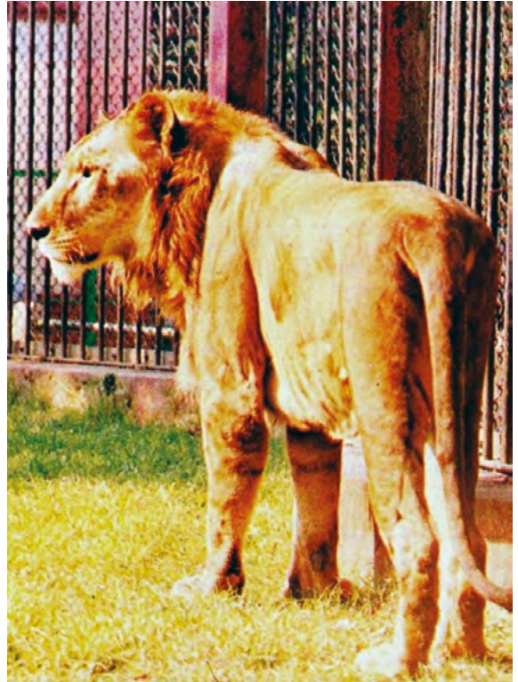
The Litigon named Cubanacan produced as a hybrid of a Lion and a Tigon(Tiger X Lion) in a controversial experiment in Alipore Zoo, Kolkata.

My personal zoo visits across three continents have taught me that Western zoos are NOT better than Indian zoos, although there is an assumption that Indian zoos are worse than Western zoos. A major concern is the continued and unchecked breeding of animals in zoos that lead to a multiplicity of problems like the one witnessed in Delhi Zoo