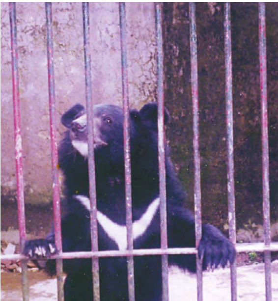
Himalayan Black Bear in Kohima Zoo.