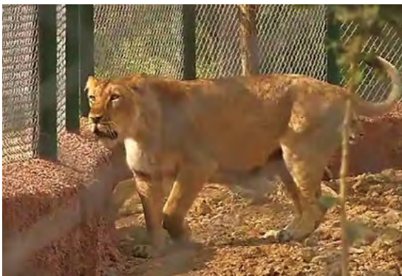
Lioness Rameshwari dies in Bokaro Zoo, Jharkhand in June 2020.

Pandemics like Covid-19 will not be the last to plague the planet. To be mindful of such crisis in the future and to start the phasing out of restrictive, badly maintained and poorly looked after zoos would be the first step in the right direction. Zoos depend on public footfall to survive, and even if there are swarming crowds to zoos or none at all - zoo animals suffer the most.