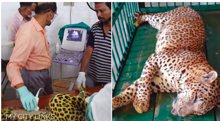
A 16 year old male leopard dies at Nandankanan.

No amount of enrichment, however, can ever make up for loss of freedom! As humans are facing this now and have come up with environmental enrichments in their daily lives like movies, social media, video calls and virtual experiences of travel and socializing,