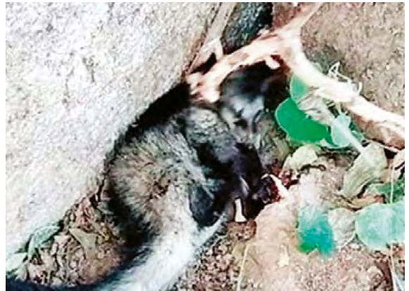
Six Common Palm Civets dead at Nandankanan.

Veterinary failure and lack of resources due to lockdowns will lead to many such unnatural deaths and the present and future pandemics is proving that the zoo business is unsustainable and financially unviable, in the current scenario and in the foreseeable future.