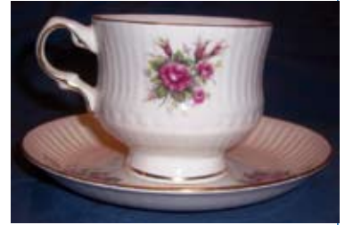
Bone china.

Fine china, bone china and ordinary china contain about 50 percent