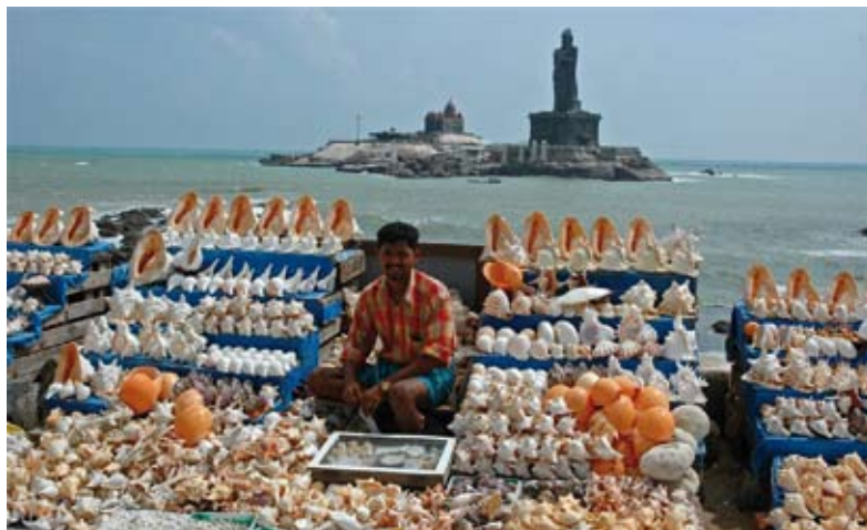
He sells sea-shells by the sea shore.

A living marine creature’s protectively hard, and often colourfully