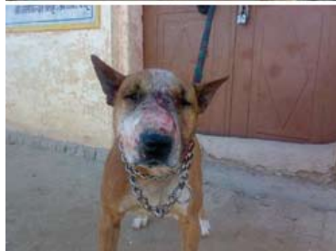
Fazilka District's dogs of war enhance their owners masculinity by their sufferings.

Dogs are also brazenly brought in by travellers on Lahore-Amritsar buses with the help of requisite certificates. Kept as so-called guard dogs in farmhouses, they are bred, sold, trained and made to fight each other.