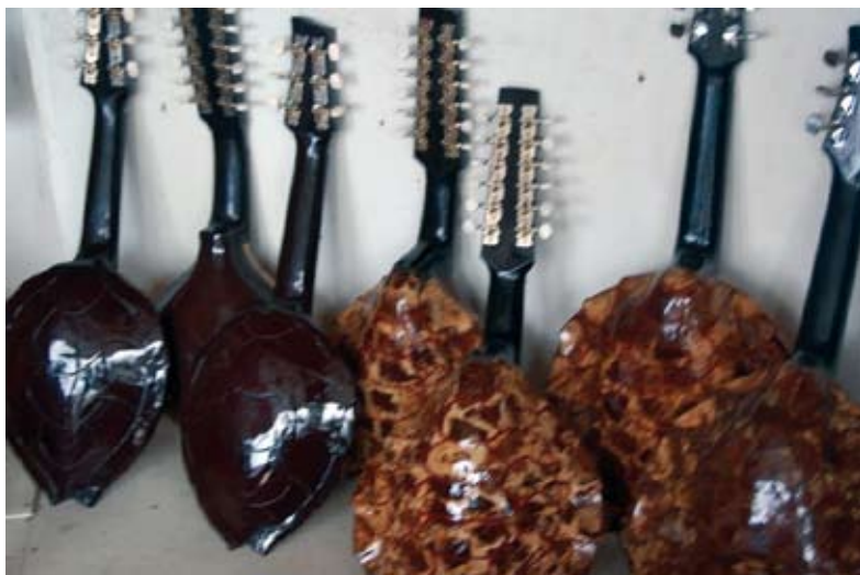
Turtle shell guitars.