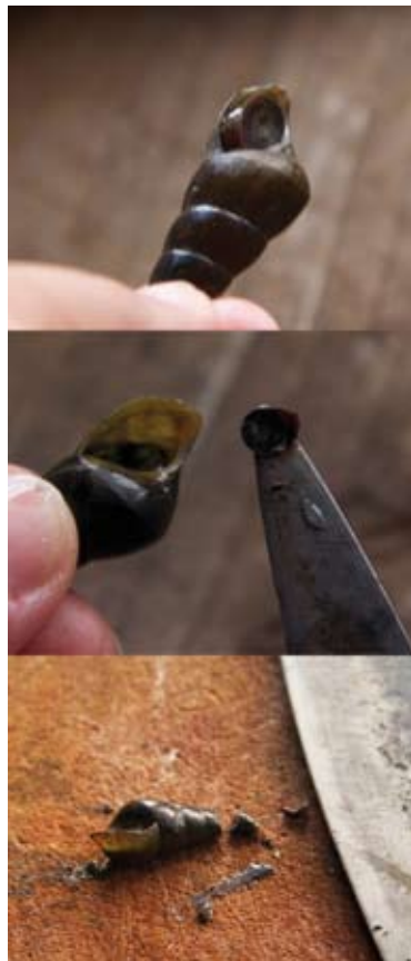
Amputation of river snails to cook Manipuri tharoi thongba .

Escargot (pronounced es-ka-go) French for snails, is one of the highlights