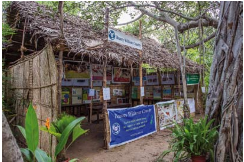
Stall set up and ready for the crowd.