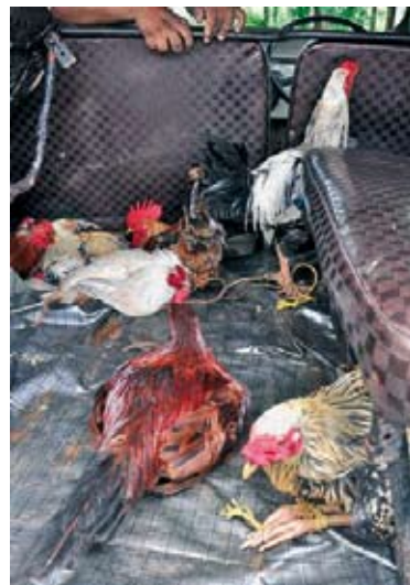
Cocks confiscated by police at Kasaragod.

BWC wrote to the Kasaragod District Collector pointing out the illegality and cruelty involved, and since he forwarded it to the Police chief, we expect positive action.