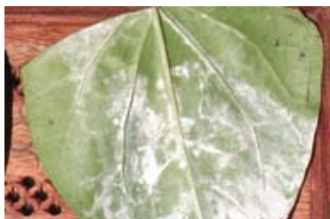
Choona smeared on paan leaves.

Trade in tortoise-shells ( bekko in Japanese) is banned under CITES, yet turtles are farmed (bred and raised to be killed for their eggs, meat and shells) in several countries.