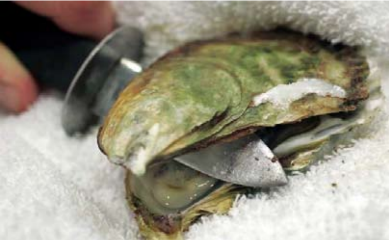
Slaughtering an oyster.

knife, adding a lime juice or vinegar dressing, and scooping out the flesh. Few like to kill and eat raw oysters thus, so they are cooked: the heat opens the shells and kills them.