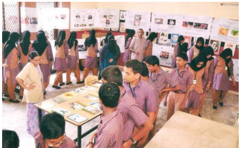
Our exhibition promotes the better world we dream of.