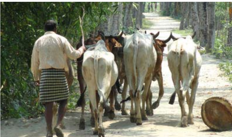
Roads of destiny.

BWC again wrote to the Union Minister of Home Affairs and to the Director-General, Sashastra Seema Bal. BWC feels legalisation should not be an option. Although cows top the list for smugglers, there is no doubt that cattle movements are closely linked to other illegal trades including narcotics, and arms and ammunition used to fund terrorism. These can be reduced to a great extent if the inter-state movements of cattle and camels are forbidden. Cattle are transported to Uttar Pradesh from Rajasthan, Punjab, Himachal Pradesh, Haryana, Uttarakhand, Madhya Pradesh and Maharashtra, from where they proceed to Bihar and on to West Bengal, Assam, Meghalaya and Tripura.