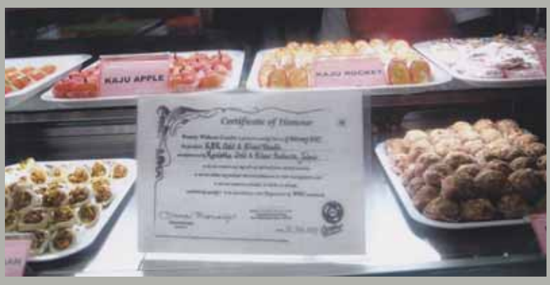
The ISKCON sweet shop in Bengaluru which utilises BWC-approved varkh.