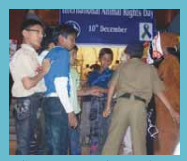
A policeman arrests the man for beating the animals.

policeman? They are discussing the matter when a boy appears with a placard in his hand saying, "Animals also have a right to live, and it is our moral responsibility to take care of them."