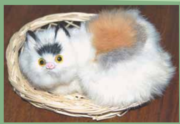
Cute: made from cat fur in China, sold in India.

500,000 cats are killed each season. About 24 cats, or 11 dogs, are necessary to make a fur coat. More are needed, of course, if kittens or puppies are used. Investigators visited a Philippine slaughterhouse where upto 100 cats are skinned daily. Male cats are preferred as the female cats' nipples reduce the marketable skin area. This has led to a dearth of male cats in the vicinity, so collectors round cats up from other cities. To do so, they stuff the cats into sacks and drive them upto six hours without food or water, to the slaughterhouse. Videos show children helping to hang the cats by the neck while other cats watch. Cat fur pelts, jackets and throws were openly sold in German petrol stations. One German importer told investigators exporting such furs to the US wasn't problematic. It was merely a question of nomenclature: house cat, wild cat, Katzenfelle, Goyangi and mountain cat were acceptable for cat furs. Dog fur needs to be labeled gae-wolf, goupee or sobaki while dog skins are called special skin, lambskin or mountain goat skin. Dog and cat skins are used for bedsheets, golf gloves, handbags and rheumatism aids.