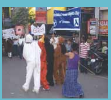
Cruel man hitting animals in the street play.

The group of men walks back wondering why the policeman reacted the way he did. Were they in the wrong, or was the