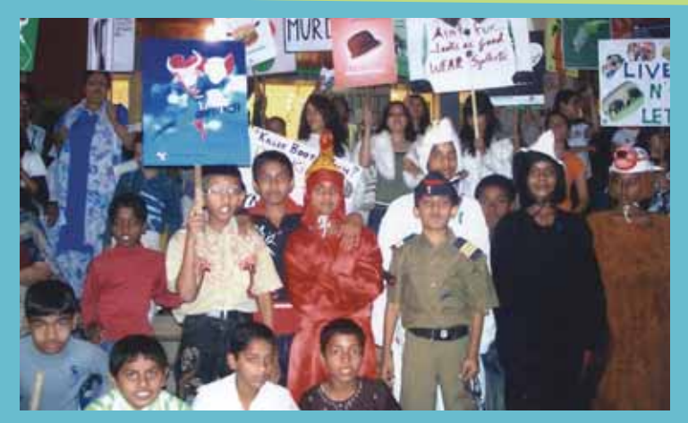
Foreground: The street play actors and actresses.

Amruta Ubale is a BWC education officer.