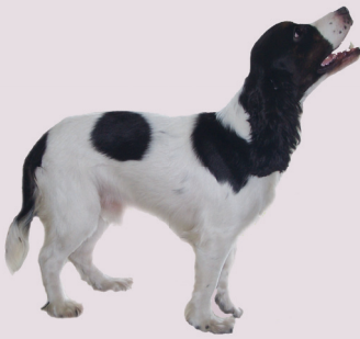
Porche Bosco with his un-docked tail

herding dogs, longer tails could be caught in gates behind livestock.”