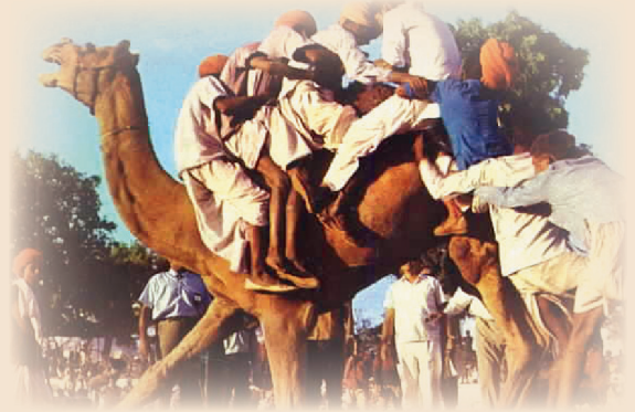
One for the Guinness Book of World Records?

The National Research Centre on Camels (NRCC), initially under the aegis of the Indian Council of Agricultural Research, started out with a mandate to develop infrastructural facilities for the conservation and preservation of camel breeds in arid and semi-arid regions, and to generate scientific and technical information. Situated