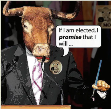
Cartoon courtesy www.sangrea.net

guidelines to be issued by the Government of Goa.