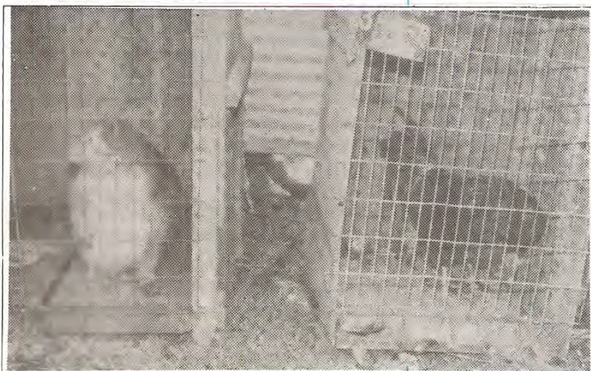
Live Animal Exhibition A monkey and a cock

Management : We interviewed a Police Inspector on duty at Shirala, and as per him over one lakh people have visited Shirala just on Nagpanchami day (i.e. 14th August 1991) alone. The fair gathers about three to four days before. On verifying the vehicle parking coupons issued by the police it was seen that more than three thousand four-wheeler and an equal number of two-wheelers had arrived. These vehicles are parked in an area stretching upto two kilometers outside the village. The traffic management had been efficient. Special State transport buses had been arranged at intervals of five minutes. The Police officials on duty consist of one Deputy Superintendent of Police, two Police Inspectors, twenty Police