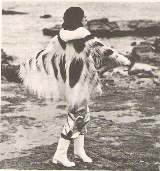
Monkey Fur Coat on sale in Japan